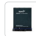
Battery (3000 mAh)